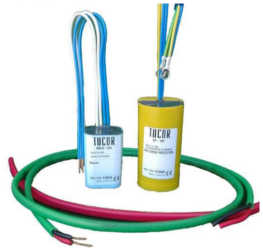
The RKLD-050 Line Decoder SP-100 Surge Protector Tucor Wire

Field disruptions due to lightning are minimized by use of the SP-100 surge protector, which safely absorbs 2-wire voltage surges. It adds substantial protection to the 2-wire path.